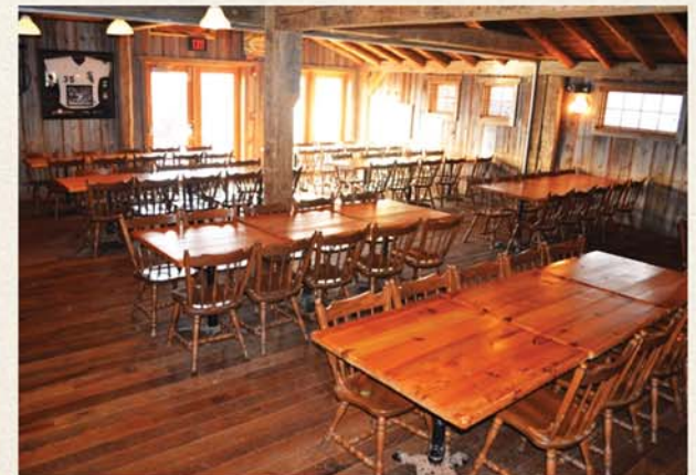
Grand Oak Room, Elgin