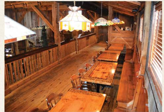
Loft, Crystal Lake