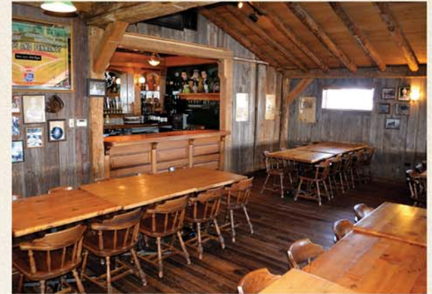
Red Oak Room, Crystal Lake