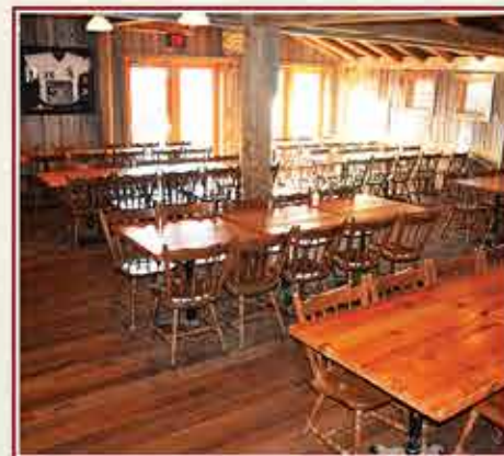
GRAND OAK ROOM - ELGIN

1. 20-25 additional seated guests | 20-30 additional guests reception style