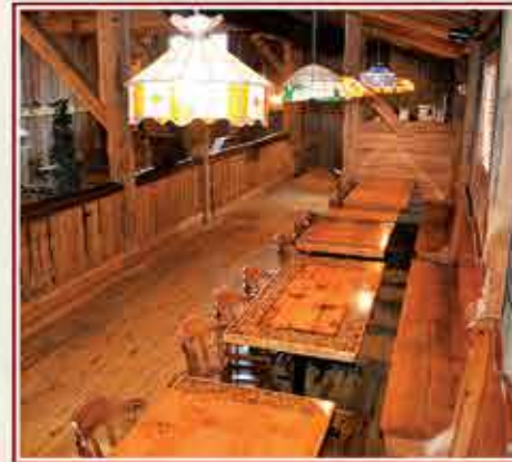
LOFT - CRYSTAL LAKE