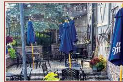
PATIO - CRYSTAL LAKE