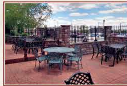
PATIO - ELGIN