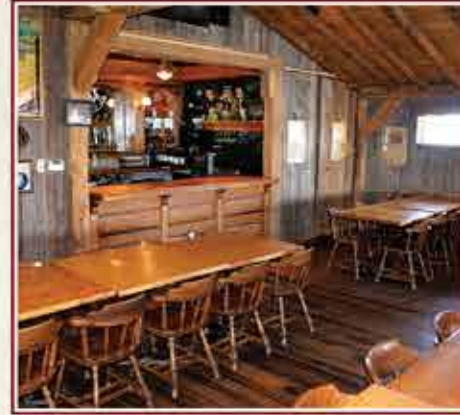
RED OAK ROOM - CRYSTAL LAKE

ELGIN PATIO Available to be booked in addition to the White Oak Room or Grand Oak Room 1/2 PATIO 3 RENTAL FEE 2 200.00+ 1/2 PATIO 4 RENTAL FEE 2 300.00+